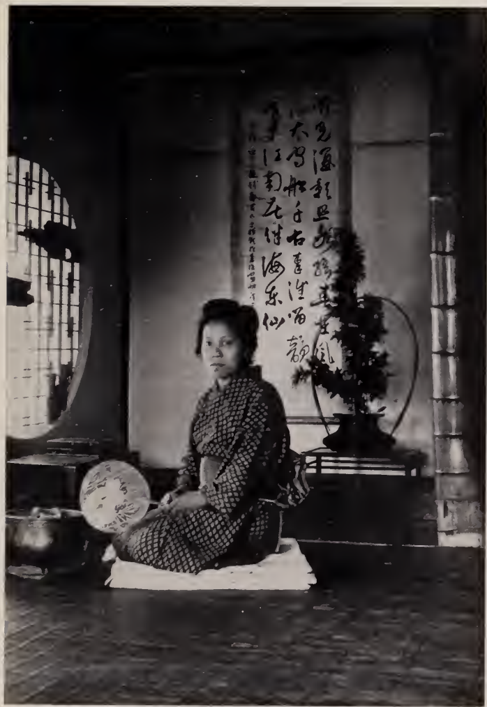
A room in an inn at Nara, showing the scroll of Good Luck, the charcoal brazier, and of course, the ubiquitous nasan or serving-maid